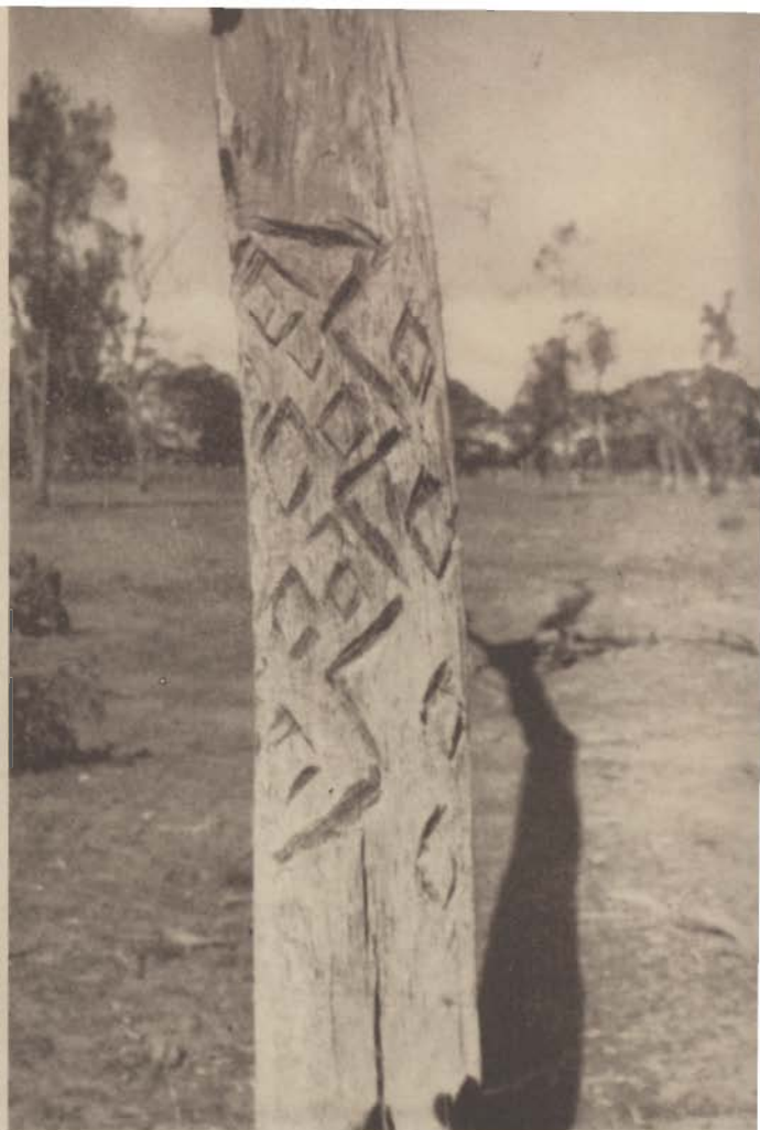
This is a comparatively recent carving, near a row of fairly recent aboriginal graves about 500 yards north of the pair shown on the previous page. It will be noticed that the workmanship (and probably the care taken in execution) is inferior to that of the older examples. It was carved with a steel axe.

northern portion of the area the representations are of animal and human figures and totemic designs, and they were used as part of the stock-in-trade of the permanent bora-grounds — sacred places where tribal ceremonial was observed, initiations took place, and important events were celebrated with corroborees.