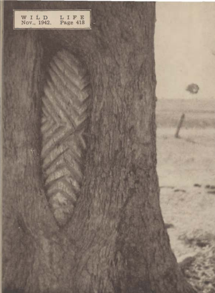
This tree carving, also fairly ancient, as indicated by the growth of bark round it (see preceding page), is on the east bank of the Yalga Creek, three miles north of the pair of carvings shown on the opposite page. The design is primitive, but obviously much care has gone into it.