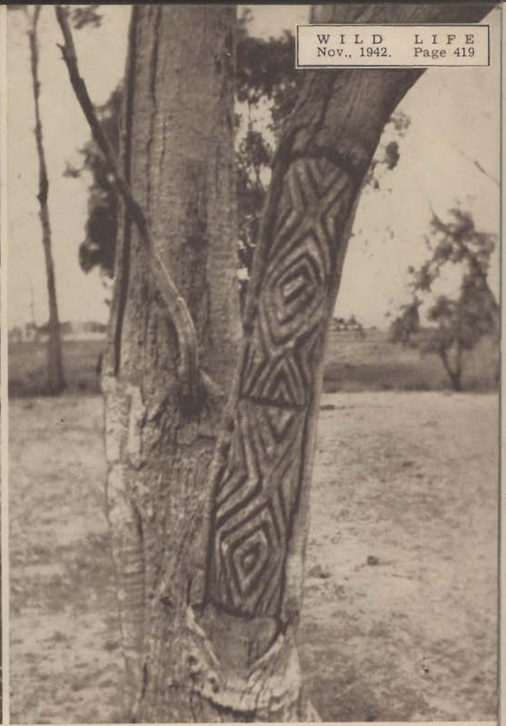
"Opposite number" to the tree on the left, ancient and weatherbeaten. Both trees have been dead for some time, so there is little overgrowth of bark. This one faces north-west.

Apparently position was what mattered more than anything else; several kinds of trees are represented among those carved, but always the grave was in the centre of the triangle formed by them, and the carvings always faced in towards the graves.